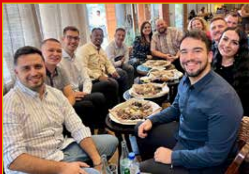
CfaN Campaign Organization Team – Ethiopia

Thank you for standing together with us!