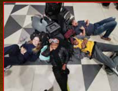
Trying to get a little rest in Accra airport