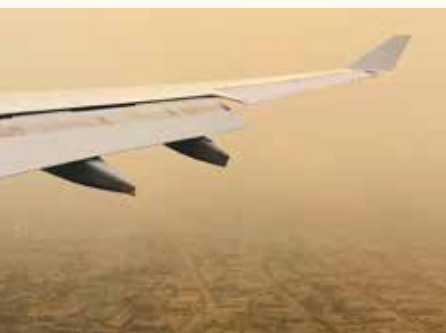
The Harmattan over Lagos; too dangerous to land