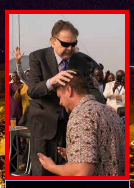
Praying with hundreds of thousands of intercessors

And numerous churches in the areas closest to the campaign field have joined together since then to hold giant prayer meetings on the field every week. People are pouring in to these meetings, because of the many stories they keep hearing of miracles and healings that are still taking place there.