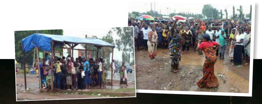
After numerous challenges and trials, the campaign in Daloa concluded with great joy and resulted in thousands receiving Jesus as their Lord and Savior.

In that moment, it seemed like we had finally reached a breakthrough. Both the following days were marked by many miraculous healings and conversions. On the second