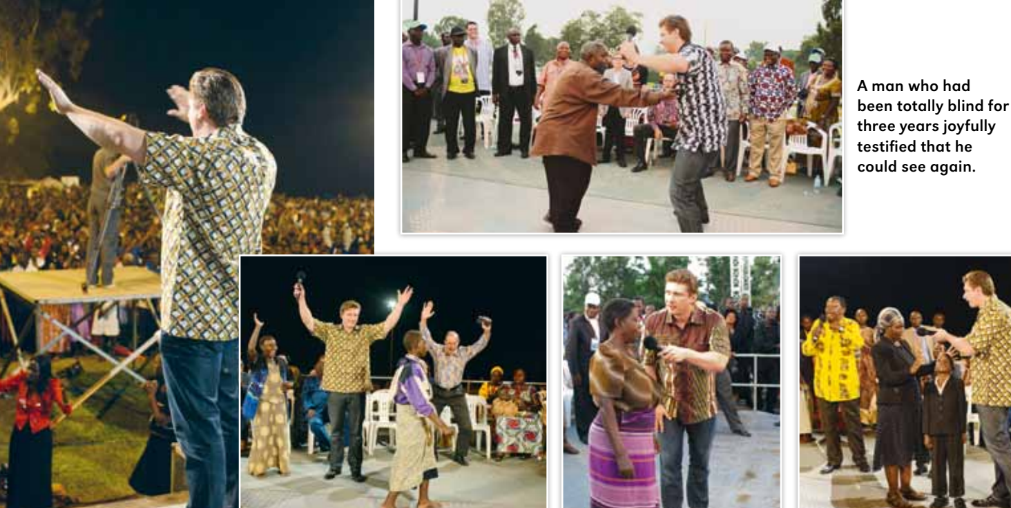
A woman whose leg had been broken in a motorcycle accident had not been able to walk properly for a year and a half. Friday night she was healed. She even did squats and danced on the platform!