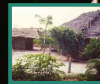
A typical home in Mafia.