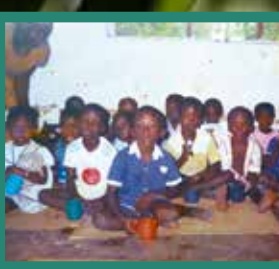
Starting a kindergarten