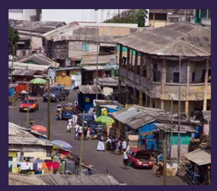
Christians are thought to make up approximately one-third of the population, while Islam accounts for another third. The last third comprises devotees of ancient nature religions.

The country of Ghana is roughly the size of the United Kingdom, with which it has maintained close historical ties since the colonial era. The official language is English, but there are just under 80 different languages and dialects in Ghana.