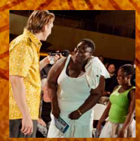
This woman had a painful breast tumor. On the second evening she was totally healed, the lump disappeared and all pain left.