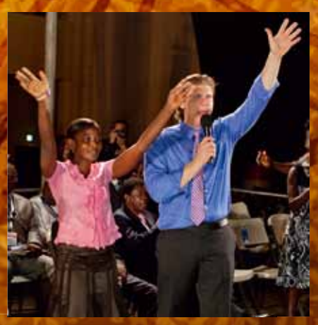
This young woman had suffered from constant bleeding for three months. As she came to the meeting, her problem vanished.